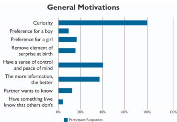
Figure 1: General Motivations Behind Early Fetal Sex Determination.

The survey began with potential general motivations that compelled expecting mothers to seek knowledge of their fetus’s sex (Figure 1).