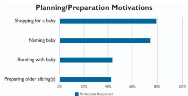
Figure 2: Planning/Preparation Motivations Behind Early Fetal Sex Determination.

The next portion of the survey detailed potential planning and preparation factors that may have influenced expecting mother’s decision to learn the fetus’s sex at the earliest opportunity (Figure 2).